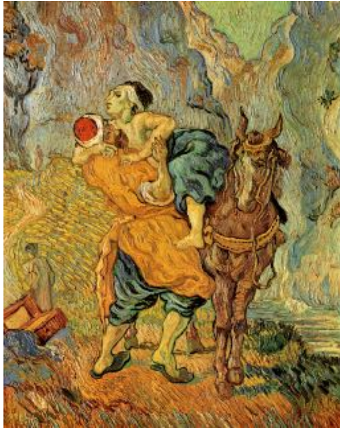
The Good Samaritan 1890 Vincent Van Gogh- Mar 30, 1853 - Jul 29, 1890 (age 37)